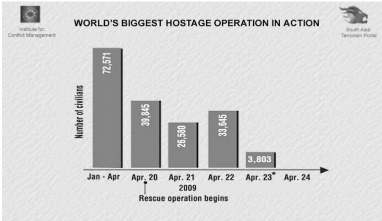
Figure 1 – Source The Daily Mirror , late April 2009.

Moon’s venture into the island is profoundly significant. It heralded the line of punishing action that the Western world and its UN handmaidens took over the next months and years. Sri Lanka was literally hauled over the coals by UNHRC resolutions from 2009 to 2012.